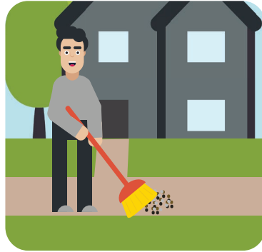
SIDEWALKS CLEARED OF DEBRIS