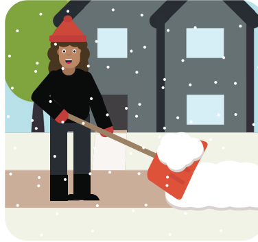
SIDEWALKS CLEARED OF SNOW