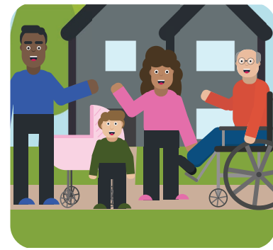
EVERYONE CAN USE!

With sidewalks clear and lawns mowed, our neighbors can easily get to the places they need to go. Thank you for doing your part to keep our sidewalks usable for everyone!